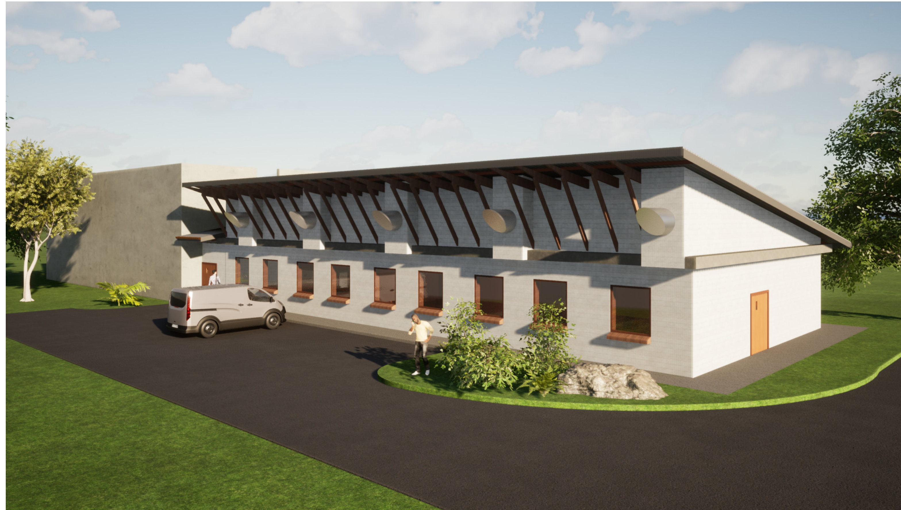
MAIN ENTRANCE AREA N.T.S