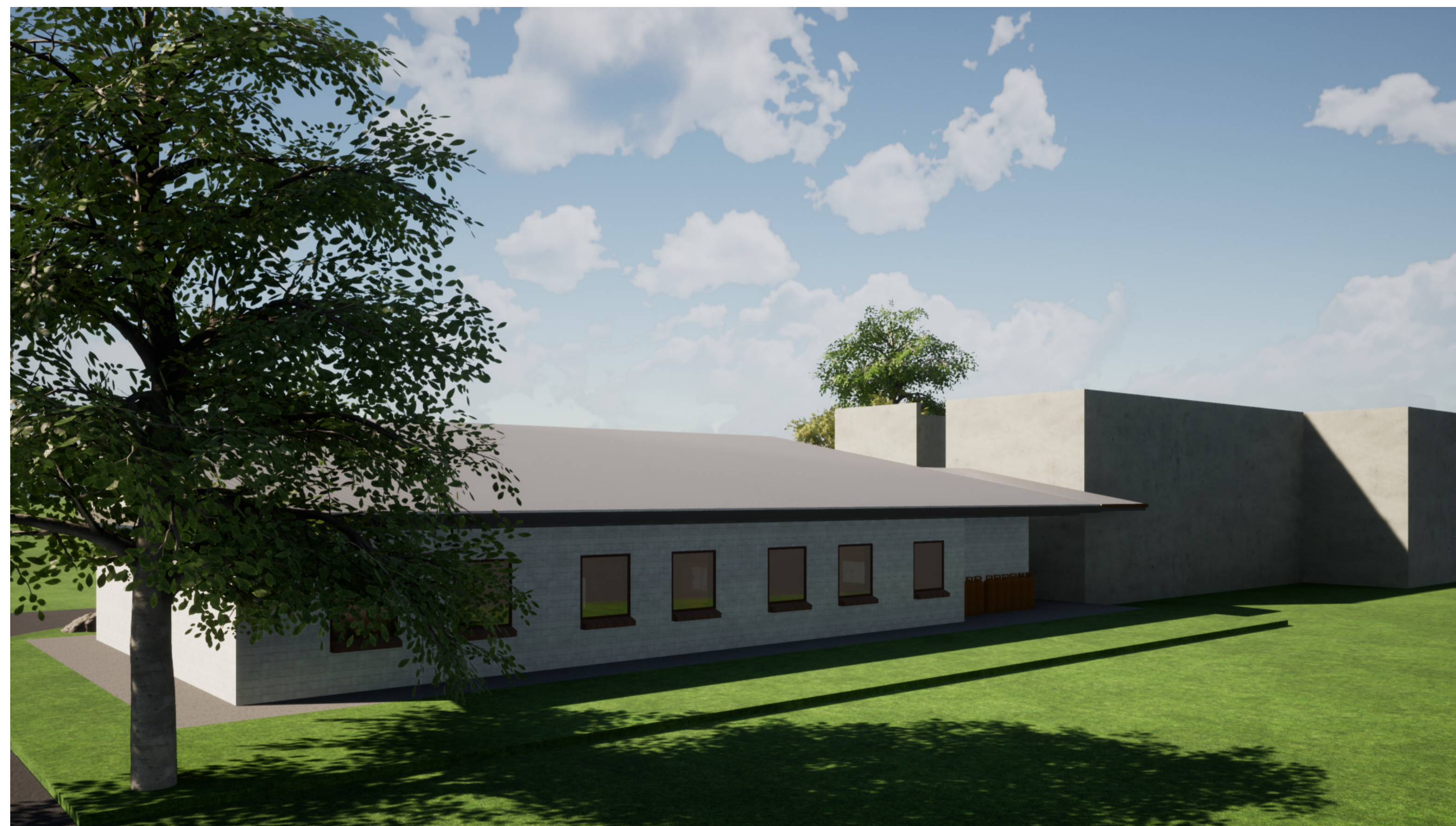
REAR ENTRANCE AREA N.T.S