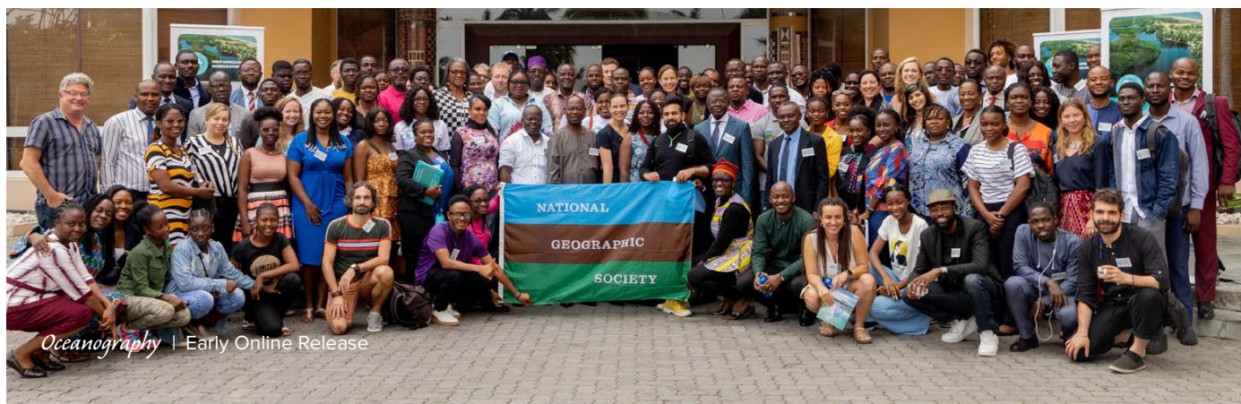
FIGURE 1. Participants in the first West Africa Marine Science Symposium, held in Ghana in 2023, are gathered here.