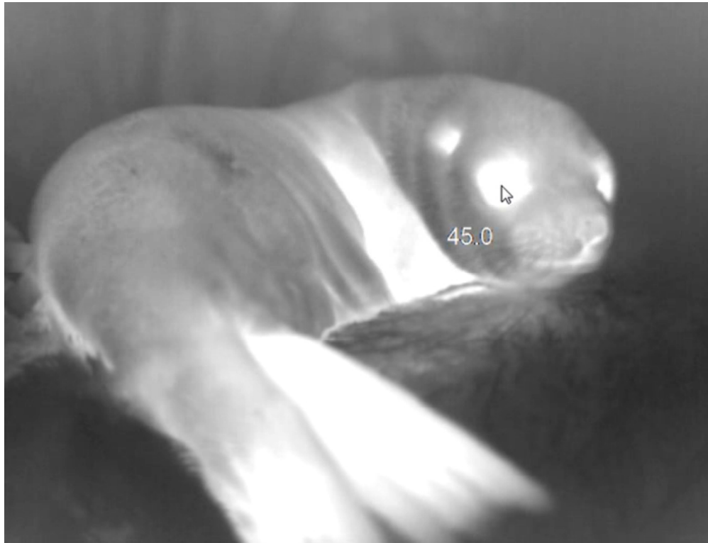
Figure 2: A close-up thermal image of a New Zealand fur seal pup taken using the Optris PL450 in Ohau Stream, Kaikoura. The number indicates the temperature in degrees Celsius of the pixel beneath the user's cursor (PI Connect™).