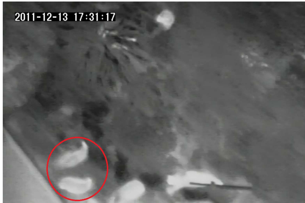
Figure 3: Photograph taken from Draganflyer X4-P Helicopter at 50 m height using a SONY NEX-5 camera (A) paired with an aerial thermal image taken using the T320 19mm infrared camera at Point Kean, Kaikoura (B).