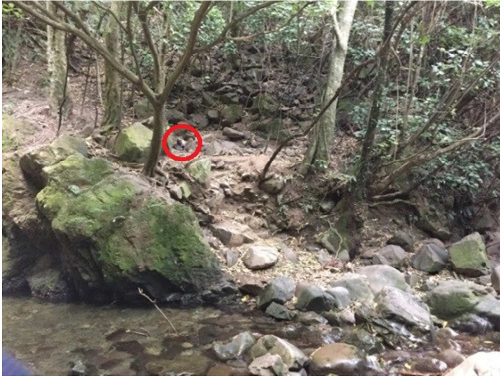
Figure 4: Photograph taken from a tripod at ground level using a SONY NEX-5 camera (A) paired with a thermal image of the same frame using the Optris PL450 at Ohau Stream, Kaikoura (B).