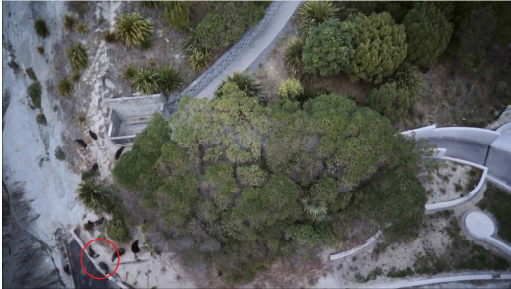
Figure 3: Photograph taken from Draganflyer X4-P Helicopter at 50 m height using a SONY NEX-5 camera (A) paired with an aerial thermal image taken using the T320 19mm infrared camera at Point Kean, Kaikoura (B).