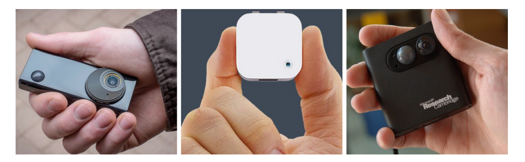
Figure 1: Three lifelogging devices: the Autographer, Narrative Clip and SenseCam.

not all of these desirable properties. The most prominent devices are probably the "Autographer" and the "Narrative Clip" [32] (left and centre images of figure 1). The Autographer was developed based on technology licensed from the SenseCam project and represents a logical continuation of it. It is smaller and lighter, features a 5 megapixel camera with a 136-degree wide-angle lens and can take up to 2,000 photos a day which are stored in its 8GB internal memory. It also has sensors to detect changing light levels, temperature, motion and orientation, as well as a GPS receiver ensuring that photos are geo-tagged. The Narrative Clip instead was developed independently with a slightly different focus in mind. In contrast to the distorted images coming from a fisheye lens, its moderate wide-angle lens (70-degree) provides "normal" pictures that are comparable to a mobile phone camera. While this means that it is unable to capture quite as much of the wearer's surroundings, its pictures are much more "shareable" with others. It is also significantly smaller than the Autographer, making it not only easier to wear but also much more unobtrusive. However, as a result of its miniaturisation, the Clip not only has fewer sensors, but also lacks direct support for GPS data: to save battery, the Clip records raw signal strength data, which needs to be uploaded to company servers in order to be converted into actual coordinates.