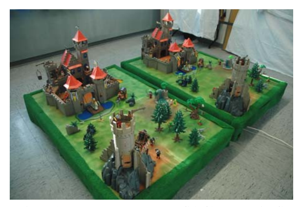
Figure 1. The two play sets, the KC (left) and the AKC (right), respectively. Both sets were equipped identically.

The Augmented Knights' Castle (AKC) is a digitally augmented play environment designed to enable various forms of contextsensitive audio feedback to take place seamlessly while playing with the characters and scenery in the play set. The audio feedback was tailored to be suitable for a Middle Ages context for children, to enhance their play and storytelling and to foster playful learning of medieval facts and stories.