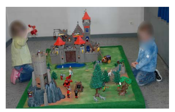
Figure 3. Children playing with the play set.

If children had another 20 minutes to play with either set, which one would they choose? 27 out of 37 (73%) chose the AKC, significantly more than choice of the KC, \chi^{2} <sup>(1)</sup> = 7.8, p<.005. Furthermore, 36 out of 37 (97%) liked having background music that fits the medieval scenario.