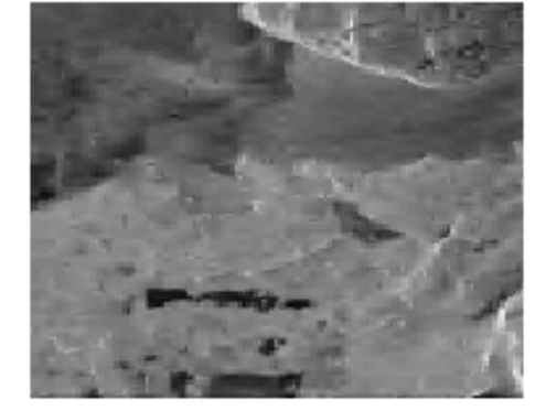
Fig. 1. Compression result at 1.2 bpp for HH intensity image