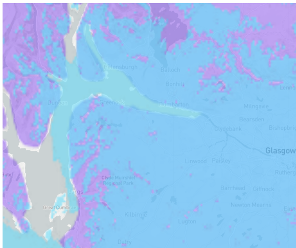
Fig. 2: Sigfox Coverage Map - Around Glasgow [1]

those areas. For example, figure 1 shows the current Sigfox coverage in the UK. The lighter areas of the map denote areas of coverage, whereas the darker areas indicate a lack of coverage. As shown in figure 1, the overall coverage is sparse, and there is a total absence of coverage outside of major population centres, making Sigfox unsuitable for rural environments. Furthermore, gaps in coverage become even more apparent upon focusing on a particular area, as shown in figure 2. The coverage around the city of Glasgow is good, but patchy on the surrounding islands (presumably due to the terrain), making Sigfox currently unsuitable for a reliable island wide deployment.