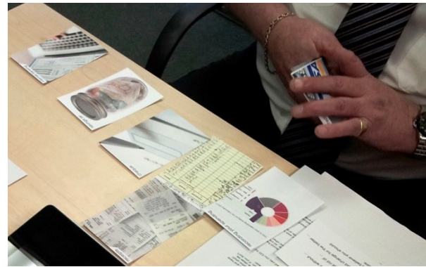
Figure 1. Prompt cards used in discussions with participants.

Participants were asked to go through the pack and respond to these four questions in their own time. Typically,