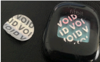
Figure 2: The Fitbit Zip activity tracker, showing a removed tamper-evident sticker. The sticker was applied to all devices used in groups 1 and 2, immediately after set-up. Each sticker was printed with the participant number to prevent participants replacing the sticker.

each year are caused by physical inactivity [7]. In addition obesity, which is strongly linked to physical inactivity, is a strong risk factor for many chronic diseases [5]. Physical activity policies and guidelines exist in many countries and are often accompanied with educational advertising campaigns aimed at increasing activity. These campaigns may be successful in increasing awareness, but many people struggle to meet recommendations [3].