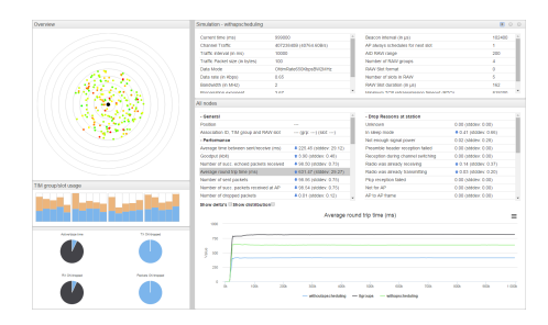
Figure 2: 802.11ah simulation visualizer