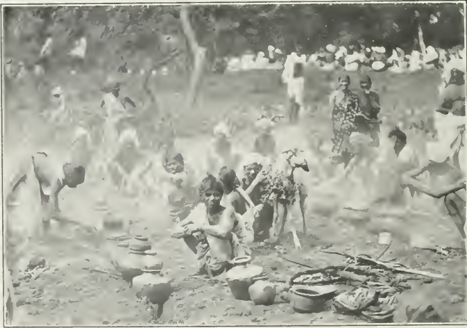
PREPARING THE SACRIFICIAL FEAST

These muggus are in preparation for a feast, and are not so much for use in the worship as for ornament. The muggus described in the text are of the same nature, but not often so large. Those designed for ornament are made by the women of the household, and not by a priest. The picture is of a Brahman home.