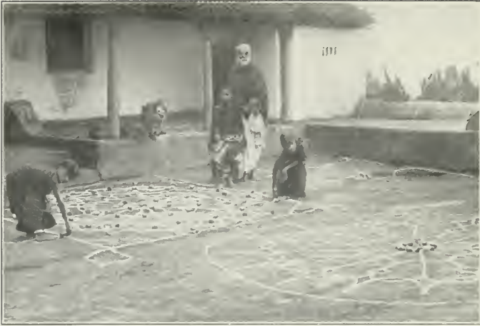
THE SACRED MUGGU

These muggus are in preparation for a feast, and are not so much for use in the worship as for ornament. The muggus described in the text are of the same nature, but not often so large. Those designed for ornament are made by the women of the household, and not by a priest. The picture is of a Brahman home.