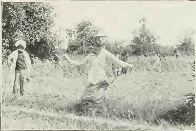
AN IMAGE TO AVERT THE EVIL EYE

This image is for the protection of the ripening grain. It appears to be a scarecrow, but it is not for the purpose of scaring birds. It is expected that this image will attract attention and so divert evil from the grain.