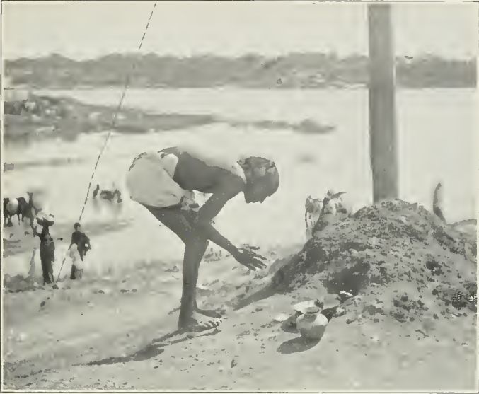
WORSHIP OF AN ANT HILL

This is a nest of the destructive white ants. It is commonly called an ant-hill. If dug out it is quickly built again by the ants. Cobra snakes are often found in these ant-hills.