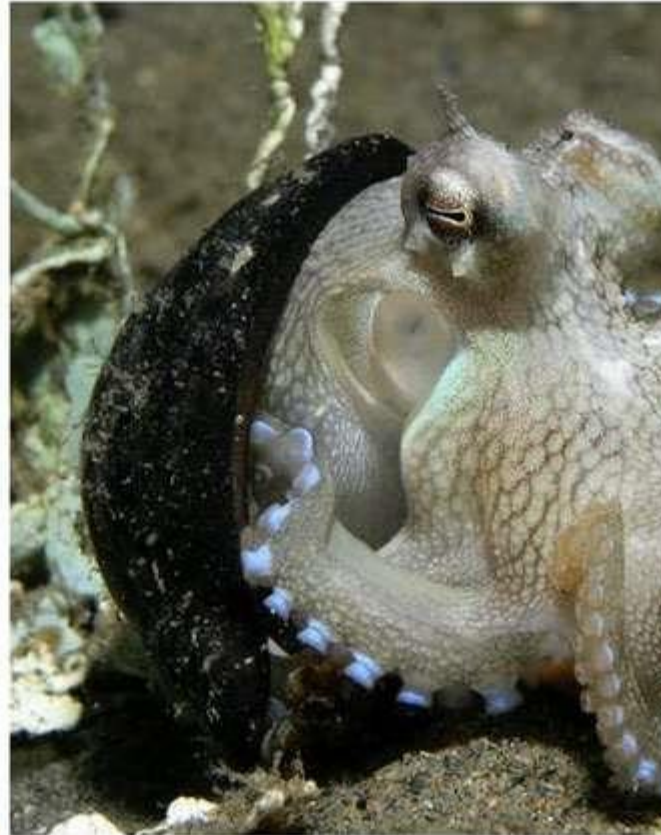
A capuchin ( Sapajus libidinosus ) using a stone tool (T. Falótico). An octopus ( Amphioctopus marginatus ) carrying shells as shelter (N. Hobgood). (Wikimedia/Tiago Falótico, Nick Hobgood), CC BY-NC-SA