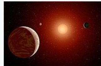
Artist's impression of the planetary system around Wolf 1061.