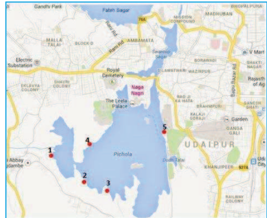
Figure 1: GPS picture of Lake Pichhola Insect collection sites:

Sampling site: Lake Pichhola was selected to study the aquatic insect diversity. It is a fresh water lake and is the main source of drinking water for Udaipur city. It is situated between latitude 24°34'54" N and longitude 70°40'35" E. This lake covers 6.96 km 2 and the catchment area of the lake is 127 km 2 .