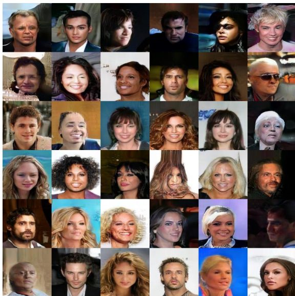
Figure 2. Generated images with 10R1_1DV

The following figure shows generated image with R1 regularization and DV regularization.