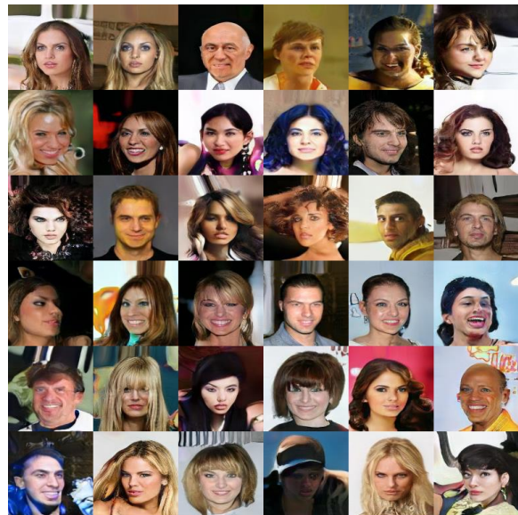
Figure 3. Generated images with 10R1_1DV, thicker model

I also trained the 10R1_1DV model with larger filter sizes. The FID of the model was 12.676382. The following figure shows the example of generated images with the thicker model.