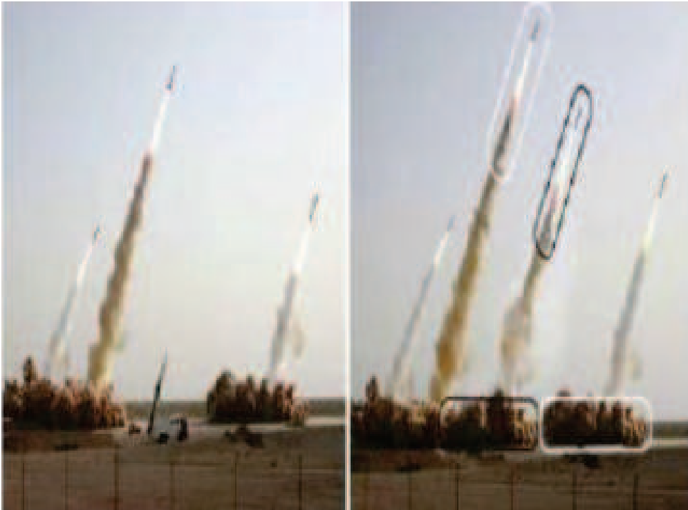
Figure 3: In the first image, there are only three missiles. But the forgers used the same image but added another missile to it in another part to make it more violent and hide the truth. But the added missile is no different from the original one. So, the forger is just copied one of the three missiles from the original one and copy-paste it into the edited one.

into another part of the same image. The forgers do it to try to hide something informative from this image or try to make it more violent than the original one.