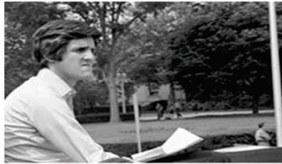
(b) Authentic Image