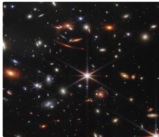
Fig. 1. Deep space universe photographed by the Webb Space Telescope

When I first proposed the turbulence model of dark matter fluids [1] , my assumption was that dark matter fluids would have uneven flow velocities during the flow process. Turbulence occurs at locations with fast flow velocities, forming visible material. But if visible matter is produced in this way, there is a question, why does the flow rate of dark matter fluid in different locations occur unevenly? Are there obstacles in the universe like coral reefs in the ocean? And how to explain why visible galaxies actually occupy a relatively small space in the universe, but the distance between galaxies can be very large. This can be confirmed in the photographs of the Webb Space Telescope in Fig. 1.