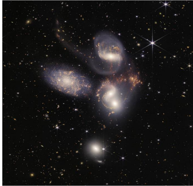
Fig.3. Stephan's Quintet was taken by Webb Space Telescope

The same structure is true for other Hickson Compact Groups galaxies.