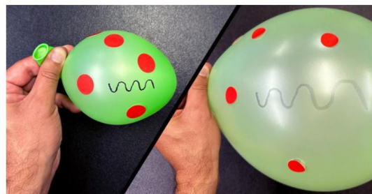
Figure 2 – Model of expanding universe with balloons and stickers

However the mathematical structure of general relativity is preserved and the machinery to affect the Fisher-Tully Law is placed in the free constant, the Cosmological “constant”. Metrics of the galaxy, considered as a Schwarzschild metric and a FLRW metric[1] shows that the non- g_{00} components of the former “swamp” the latter, such that near or within the galaxy, only matter, EM radiation and the energy density of some modified \rho_{vac} gravitate, with no expansion of space. The situation is akin to what is shown in figure 2.