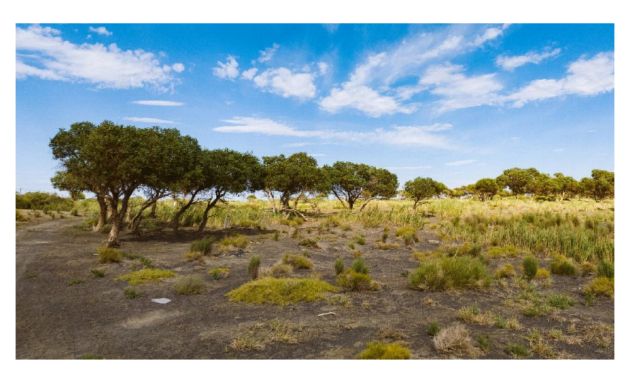
Figure 1: a picture.

water today. Is it composed of molecules or atoms? Is the object itself colored, or is it the light it reflects? The nature of the cup can vary under different conditions and in different environments. Precise descriptions depend on the specific environmental conditions.