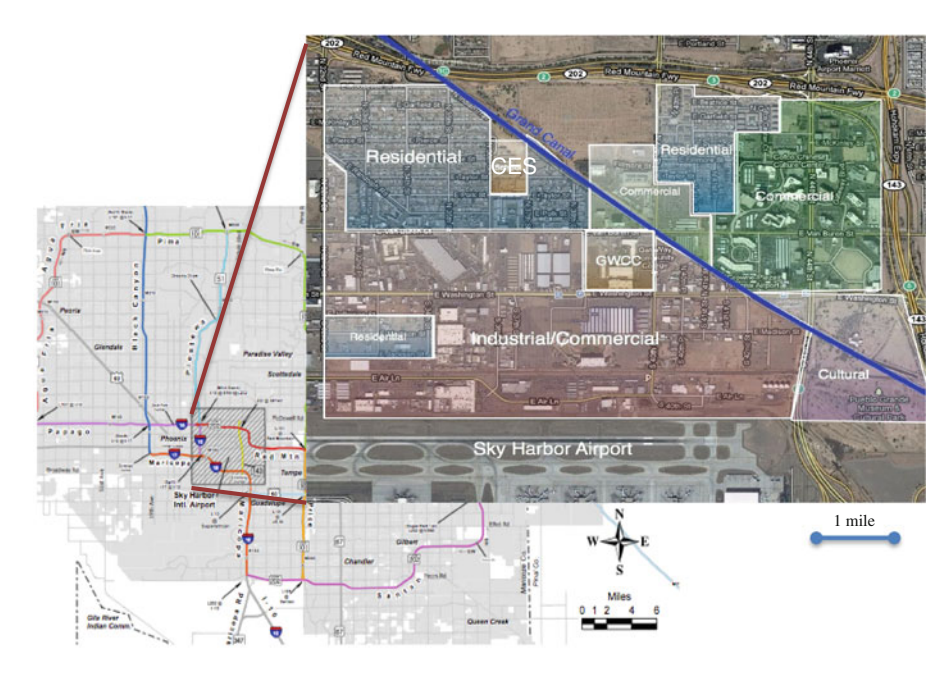
Fig. 1 Gateway Community Corridor in metropolitan Phoenix. GWCC Gateway Community College, CES Crockett Elementary School. Note The zoning demarcations are based on fieldwork and do not necessarily match published city records

population earns below established poverty levels, median household income is $33,392, and one-third of residents (33 %) do not have high school diplomas or equivalencies (USCB 2010b). These data provide a limited snapshot of the community; yet, they indicate significant needs and barriers to sustainable community development.