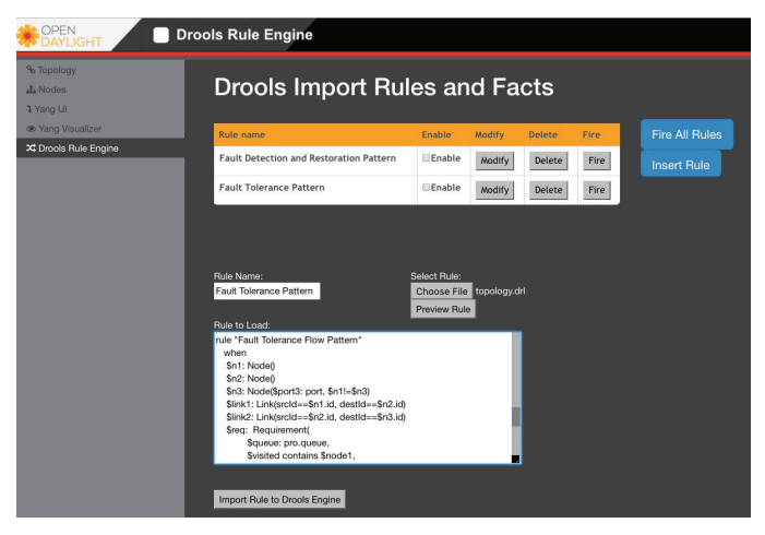
Fig. 2: OpenDaylight SDN Pattern Framework GUI