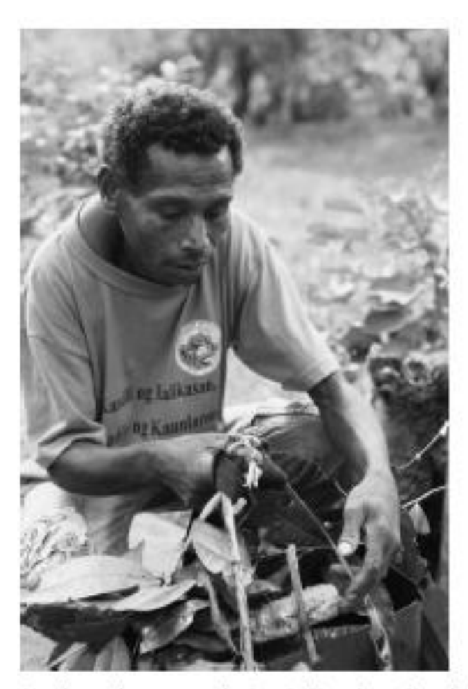
FIGURE 4 Collecting honey using the hweak.

and the equitable rotation of the role of volunteer and gasak owner sustains the practice (Tebtebba Foundation Indigenous People's International Centre for Policy Research and Education, 2008).