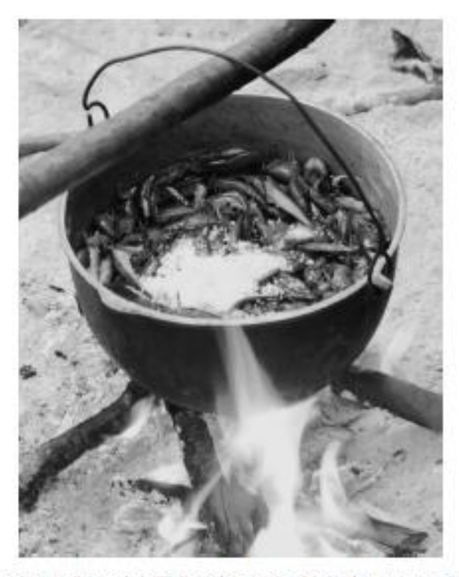
FIGURE 2 Freshwater fish and shellfish cooking with added salt over a standard wood fire.