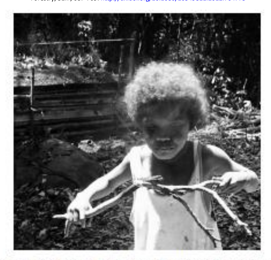
FIGURE 7 Igniting the traditional kiln (note this method is identical to starting cooking fires).