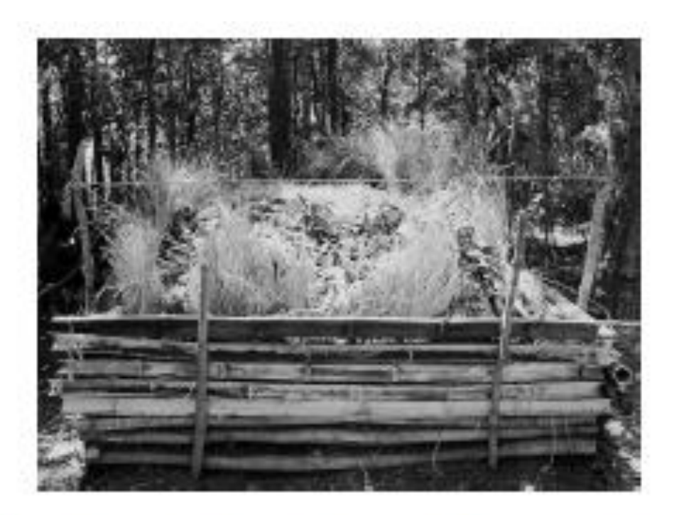
FIGURE 6 Acta traditional built-up earthen charcoal pit kiln prior to ignition.