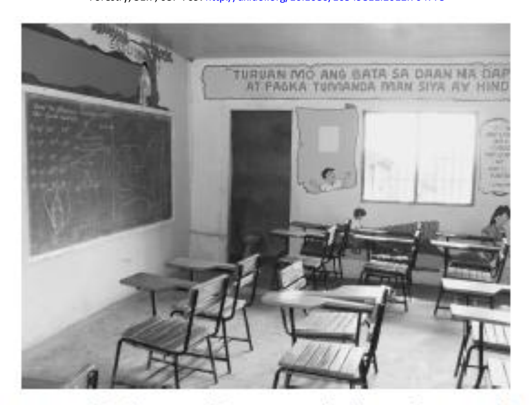
FIGURE 9 One of the classrooms of the Biaan Aeta School in Mariveles, Bataan.