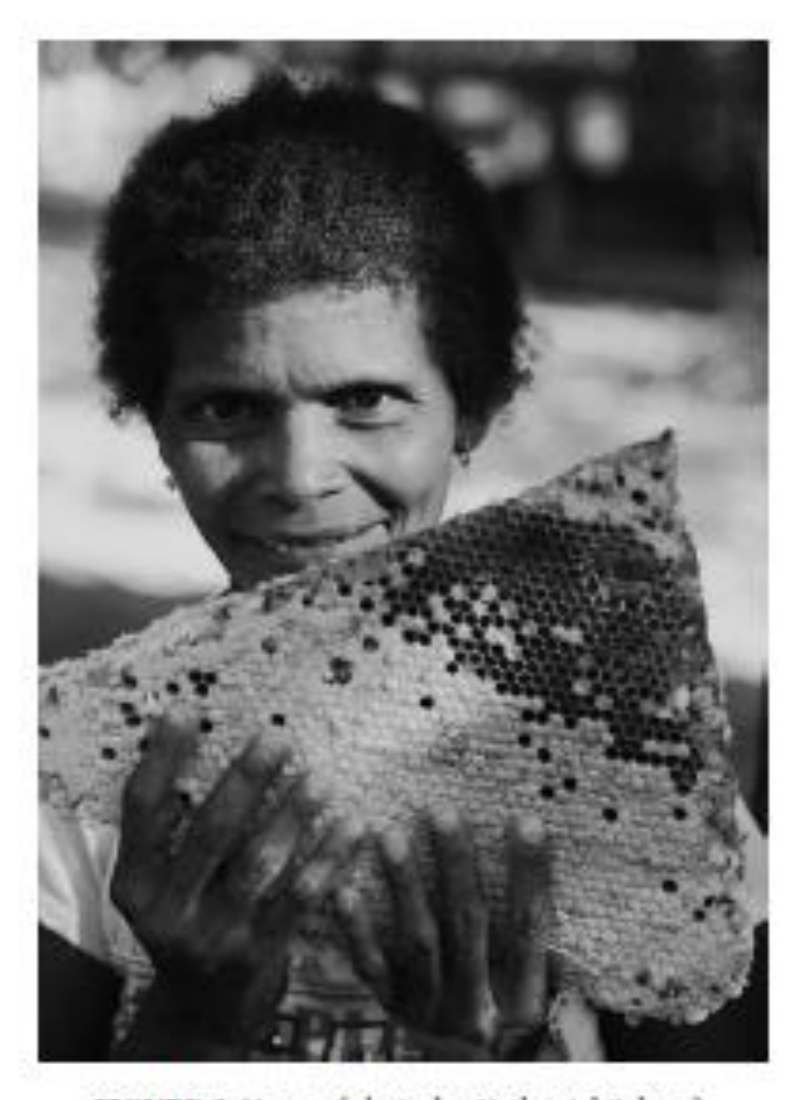
FIGURE 3 Honey.

Among the Aeta Magbukún, an unharvested beehive is considered individual private property once it has been marked. It is considered fortunate whenever a panilan (beehive, and also refers to the honey bees) is situated near the ground. However, it is not difficult for the limber climbers of the tribe to harvest a beehive high up in the forest canopy. Smoke from a lighted torch made from leaves is used to drive the honeybees away. Between 3.5–7 L of pulot can be harvested from a large panilan . In recent years, there has been a small, yet growing commercial market for pulot , and the Aeta of Mariveles supply orders for some private companies, and also the University of the Philippines in Los Baños. Pulot has become the major cash income for the Aeta Magbukún tribe in Biaan, Mariveles.