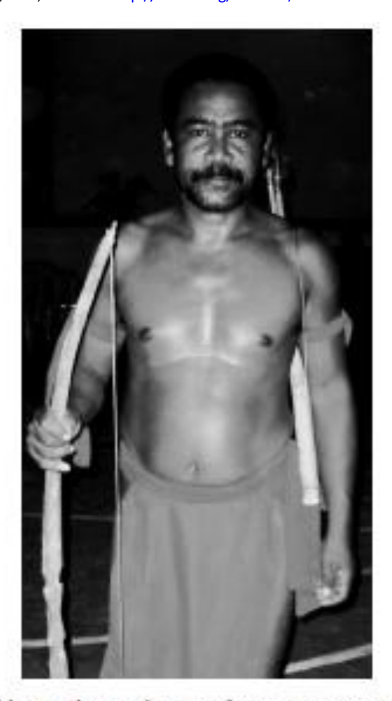
FIGURE 8 Traditional hunting bow and quiver of arrows, more recently used ceremontally.