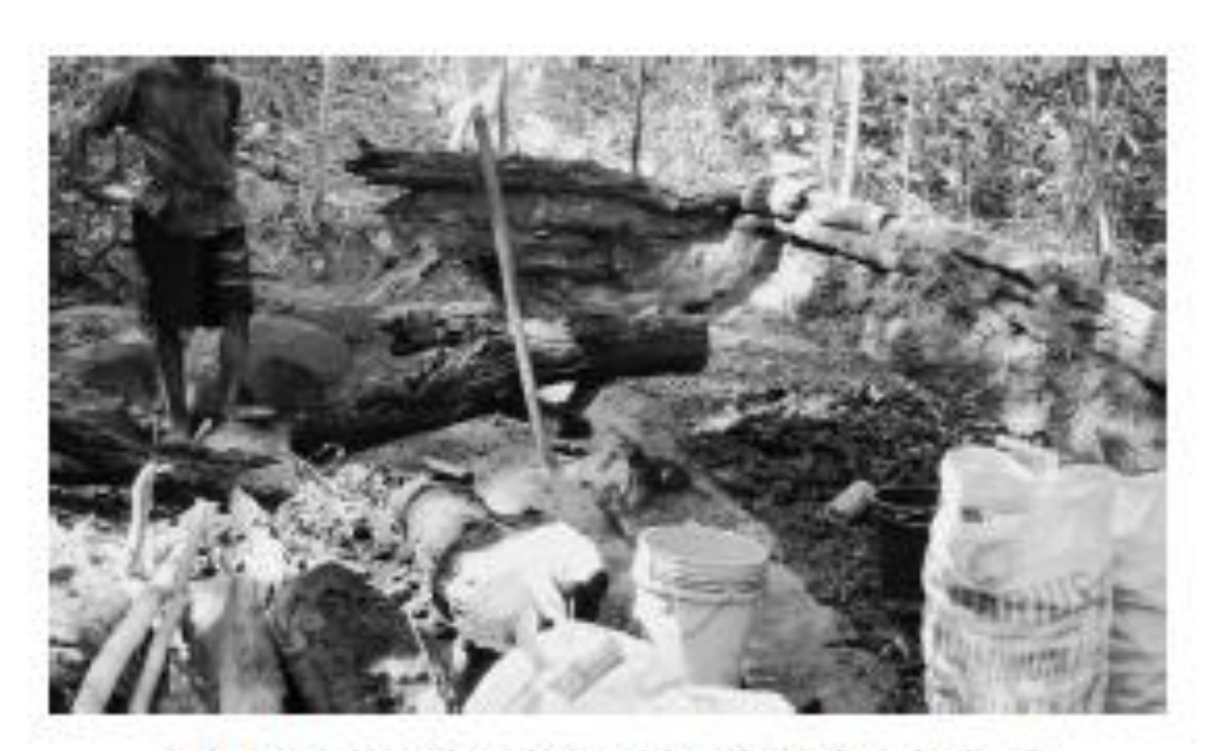
FIGURE 5 Charcoal production.