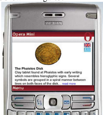
Figure 3: E-museum Screenshot

As far as the implementation is concerned, we chose to use a Nokia E61 smart phone with Symbian OS, a 3COM 802.11g WLAN access point and a Linux HTTP and MySQL Database Server. A screenshot from the mobile device used is shown in Figure3.