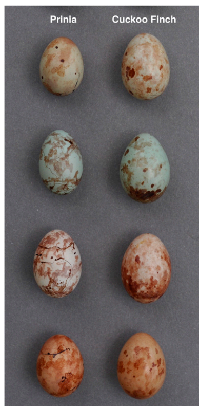
Fig. 1. Host eggs ( Left ) and parasitic eggs ( Right ), illustrating variation in color and pattern. Egg color variation is continuous in avian color space, but to human eyes eggs can be broadly categorized as (from top to bottom) olive, blue, white, or red. In this image, pairs of eggs have been matched according to these categories and do not necessarily come from the same parasitized clutches.

Average pattern proportion (the proportion of the egg surface covered with markings; Methods ) did not differ between host and parasite, whereas PC energy (a synthetic measure of marking contrast and variability) was significantly higher on average in parasites, but highly variable in both parties (Fig. 2). Three pattern variables differed highly significantly between host and parasite: proportion energy (the relative importance of the dominant marking size) and pattern dispersion (the degree to which markings were concentrated toward the thick end of the egg) were both higher in parasites than hosts, whereas filter size (an inverse of measure of predominant marking size) was lower (Fig. 2). This implies that parasitic egg patterns were on average composed of larger markings than those of their hosts, tended to be more dominated by a single marking size, and were typically more concentrated at one end of the egg than those of their hosts. These differences are intuitively visible to a human eye in the sample eggs shown in Fig. 1.