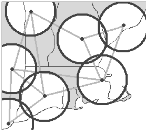
Figure 2. Minimum distance constraints imposed upon seven critical facility example

The fourth step of the proposed secure site location process is to use the minimum and maximum constraints and the proposed set cover model to determine the minimum number of facilities that can be employed to meet the standards set by management and to identify areas where the facilities can be located. In this seven city