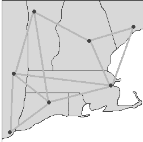
Figure 1. Supply chain network for seven critical facility example

already completed step one of the process and have identified all of the critical materials, supplies, and equipment needed for each emergency storage location.