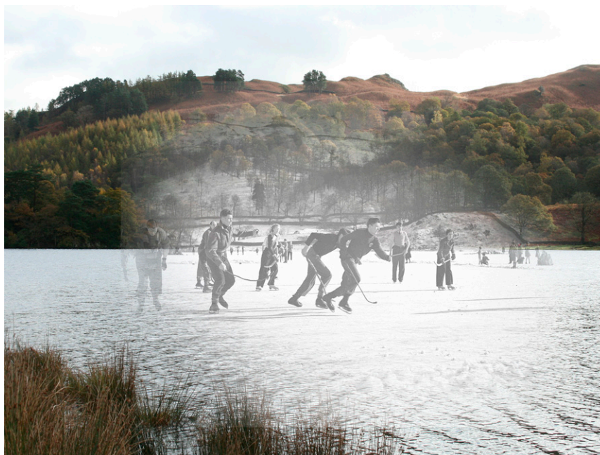
FIG. 3. Skating through Time: A composite image depicting ice hockey on a frozen Rydal Water in 1947 and the same lake today.

for a participant's submission might have influenced who responded (nonrespondent bias) and the content of their response (data validity and accuracy), were taken into consideration (White et al. 2005). Rather than viewing the collection of data using different methods as a problem for comparative analysis across the information compiled, we used it to actually inform the effectiveness of the experimental design as we and our respondents moved through the project. The design of the project and the staged approach to the research were thus influenced by both the medium and the content of the initial submissions we received. For example, when a participant submitted a digital photograph or personal reflection via social media, we contacted them and asked if anyone in their family had any comparative older photographs or reflections, inviting them to share them and hear about others' accounts of the same events at our public workshop.