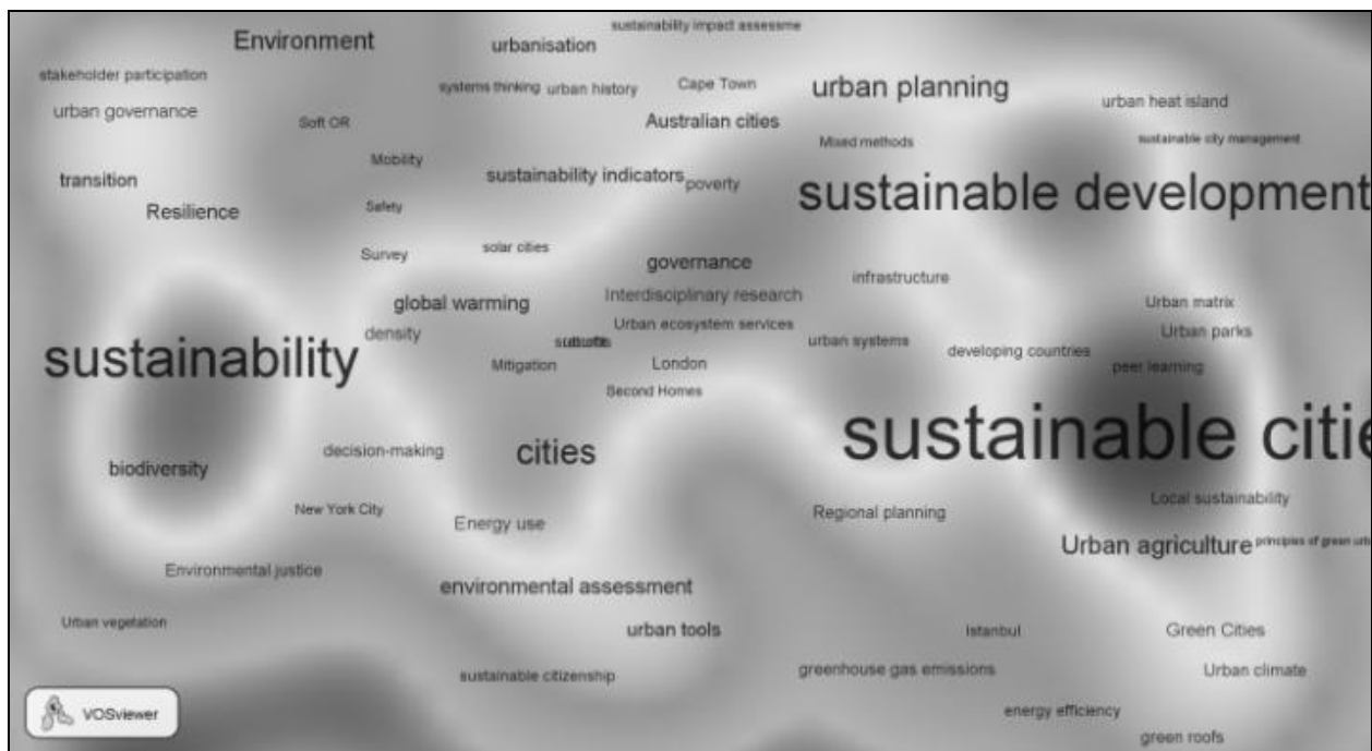
Figure 1. Main results of bibliometric analysis through VOSviewer.

Starting from the database of 367 contributions, the most relevant and frequent keywords have been pointed out, thanks to the software as presented in the following representation (Figure 1) through a map of density. In detail, this graphic led to observe the importance of the linkages emerging between a central topic and a connected one through the colours of the areas and dimensions of typefaces.