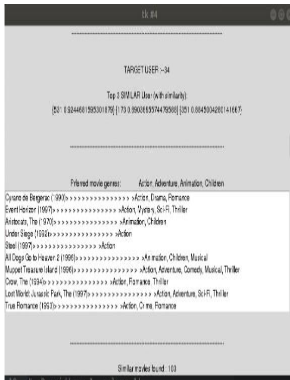
Figure 4: Generating recommendations to the target users

The output of the results is generated as follows :