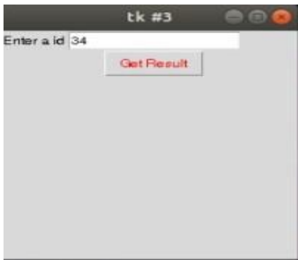
Figure 3: The first pop screen asking for user id

Screenshots of the outputs generated are: