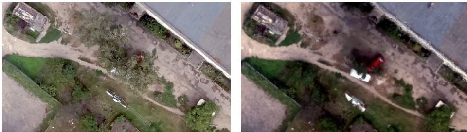
Fig. 2. Fragments of a building's image on a traditional orthophotomap (left) and on the orthophotomap designed using the proposed method (right)