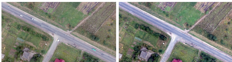
Fig. 4. Depiction of a tent on a standard orthophotomap (left) and on the orthophotomap designed using the proposed method (right)