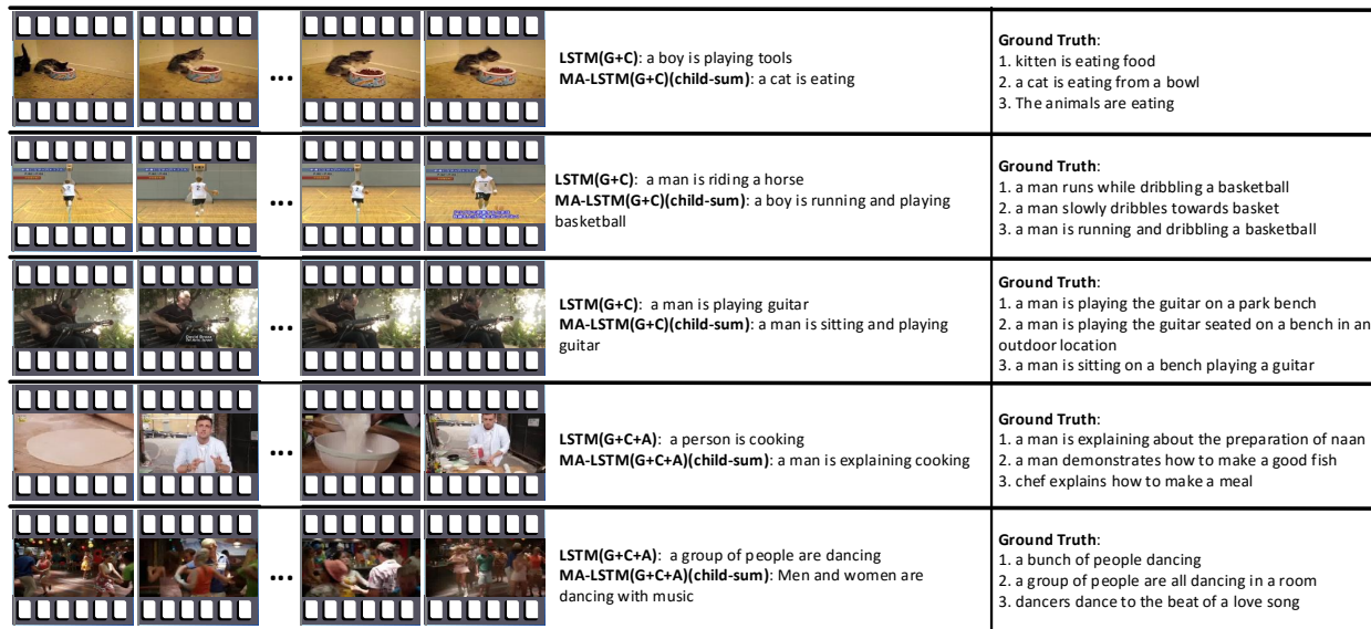
Figure 4: Sentence generation results on MSVD (the first three examples) and MSR-VTT (the last two examples). The videos are represented by sampled frames, the output sentences generated by 1) LSTM, 2) MA-LSTM with child-sum fusion and 3) Ground Truth: Randomly selected three ground truth sentences.