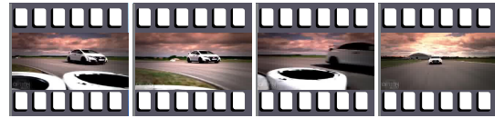
A white car is driving fast through a sharp curve with soft music on.

Automatic generation of natural language description for video, a.k.a. video captioning, has played a fundamental challenge and received extensive research interest in both