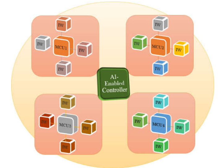
Fig. 3. Envisioned cluster network of Internet of Intelligent Walls enabled by AI controller

could be used as an illuminator of opportunity where an ambient signal from 5G base station will be cross-correlated with echoes reflected from the subjects in the area under test, to extract information on their movements. With the help of ambient 5G signals, they can obtain full-scene images with high resolution and recognise human-body postures and vital signs with high accuracy in a smart, real-time and inexpensive way [21]. The processing can be performed at the AI-enabled controller connected to the IW. The IW will act as a primary surface mounted indoors. In a situation where the patient has a symptom of a heart attack or an elderly patient falls over, the AI-enabled controller would instruct a secondary IW to redirect the ambient mmWave signal to the dedicated emergency response radio link. The IW could be mounted outdoor communicating with a 5G base station. It is important to mention that the AI controller could be connected to multiple IWs with different operational requirements. The application is demonstrated in Fig. 2, scenario A and D.