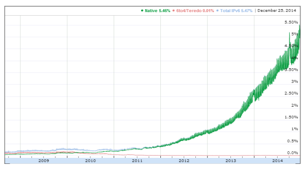
Evolution of IPv6 traffic on Google's servers<sup>v</sup>

IPv6 has been deployed globally and the move towards its adoption is increasing. By the end of 2014, IPv6 traffic represented over 5% of Google Internet traffic, doubling about every 9 months.