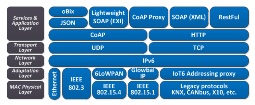
IoT6 protocol architecture