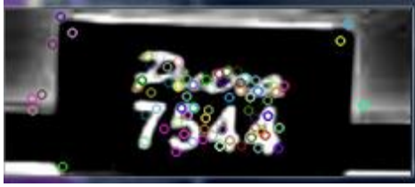
Figure 5: Input image with detected SIFT keypoints

in different views of the same object with a Gaussian scale-space function. Then difference of Gaussian (DoG) function is calculated by computing the difference between two images. DoG is then applied on a set of re-sampled images to obtain the extreme points. To improve confidence in the final keypoints, low contrast points and poorly localized points on the edges are disposed. The best match for each keypoint in the input image is found by finding its nearest neighbor in the template image by computing the Euclidean distance from the given descriptor vector. A least square-based method is used to verify each identified group of features and finally to discard the outliers of remaining points. If there are less than remaining points after verification stages, the match will be rejected.