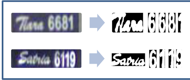
Figure 2: Segmentation of Special Malaysian License Plate

This paper is organized as follows. Section 2 presents the related works. Section 3 describes special plates recognition algorithm based on SIFT feature. Section 4 presents the experimental results and conclusion is given in Section 5.