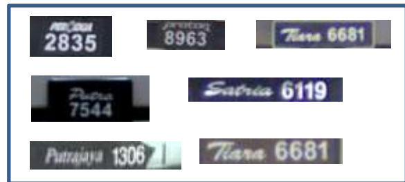
Figure 7: Samples images failed being identified as special plates

There is 18.67% of false negative result. This is due to condition of the detected plate image are too blurred or too small where SIFT features are difficult to be extracted for matching process. Figure 7 shows some sample images that are wrongly identified.