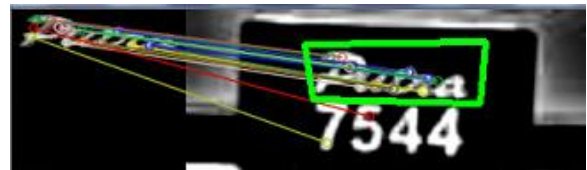
Figure 5: Result of Matched Template in License Plate after Homography Estimation Process

The highlighted green bounding box shown in Figure 5 below is the matched object in the license plate image.