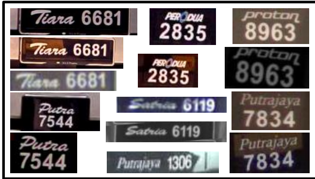
Figure 6: Samples images for algorithm testing

The algorithm has been tested with 500 license plate images which consist of 150 special license plate images and 350 standard plate images captured during daylight at four different locations. There are six types of special license plate being tested in this paper, which are Perodua , Proton , Satria , Tiara , Putrajaya and Putra . This is because these kinds of special plates bearing prefixes that are Figure 6 shows some sample images used during testing process.