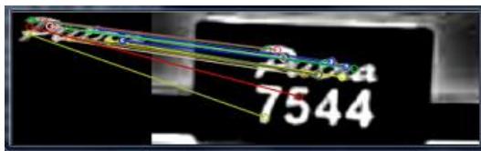
Figure 5: Matched keypoints between template and input image

SIFT feature points are stored according to each special prefix in template. Recognition process is performed by comparing a set of extracted feature points between the detected plate and each of the templates based on their Euclidean distance as a common measure of their vectors. After matching two images one gets a vector of good matches which are subsets of keypoints that agree on the template and its location, scale and orientation in the input image. Along with that, two sets of keypoints obtained from template and input image will be used in the matching process.