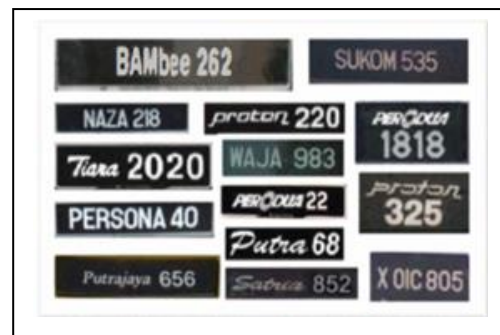
Figure 1: Samples of Special Malaysian License Plate

started with alphabets and ended by numbers. However, there are some exceptions to the standard format plate. One of the exceptions is the special license plates (as shown in Figure 1) which have been introduced from time to time to commemorate certain events or occasions.