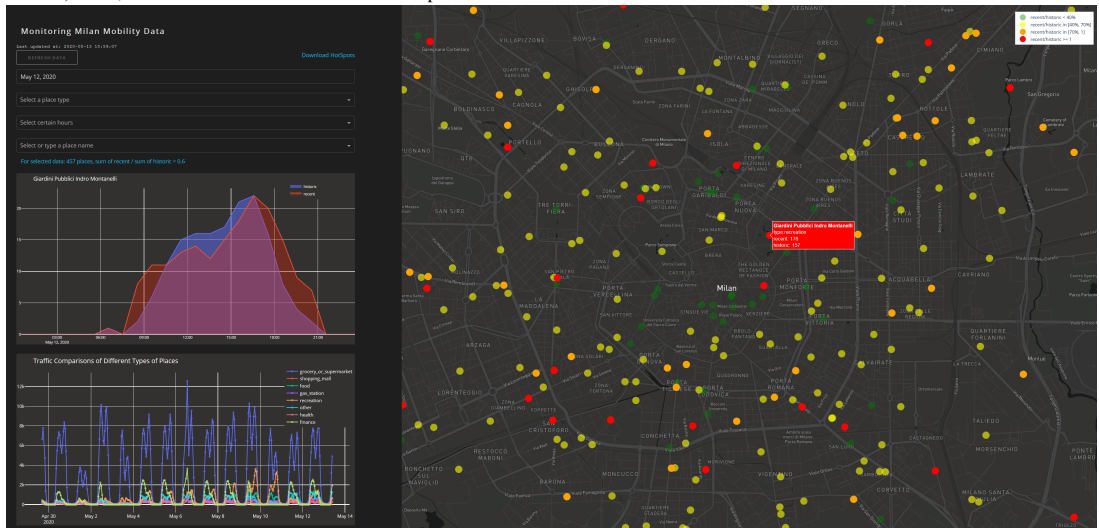
Figure 2. Screenshot of data visualization for Milan, Italy. On the right, each dot represents one of the 457 locations for which live visit information was collected on Tuesday, May 12, 2020. On the left, detailed information for the selected location, the public gardens “Giardini Pubblici Indro Montanelli” is shown. For that day, the sum of live/recent information, shown in red, was 176, whereas the sum of normalized typical visit information, shown in blue, is 157. Across all the 457 locations with live information on that day the (sum of recent)/(sum of historic) is 0.6, shown on the left below the selection options. .

released roughly once a week. Though our approach lacks in completeness of its coverage, as it only includes fairly popular locations, it does afford the benefits of POI-level up-to-the-hour information.