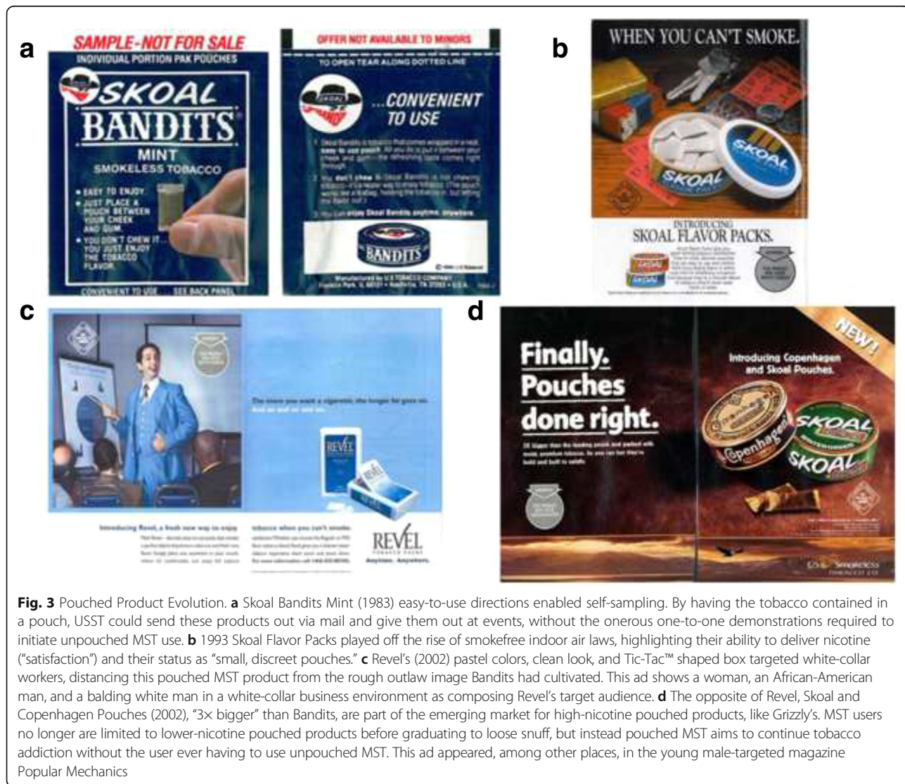
Fig. 3 Pouched Product Evolution. a Skoal Bandits Mint (1983) easy-to-use directions enabled self-sampling. By having the tobacco contained in a pouch, USST could send these products out via mail and give them out at events, without the onerous one-to-one demonstrations required to initiate unpouched MST use. b 1993 Skoal Flavor Packs played off the rise of smokefree indoor air laws, highlighting their ability to deliver nicotine (“satisfaction”) and their status as “small, discreet pouches.” c Revel’s (2002) pastel colors, clean look, and Tic-Tac™ shaped box targeted white-collar workers, distancing this pouched MST product from the rough outlaw image Bandits had cultivated. This ad shows a woman, an African-American man, and a balding white man in a white-collar business environment as composing Revel’s target audience. d The opposite of Revel, Skoal and Copenhagen Pouches (2002), “3× bigger” than Bandits, are part of the emerging market for high-nicotine pouched products, like Grizzly’s. MST users no longer are limited to lower-nicotine pouched products before graduating to loose snuff, but instead pouched MST aims to continue tobacco addiction without the user ever having to use unpouched MST. This ad appeared, among other places, in the young male-targeted magazine Popular Mechanics

In 2006 the leading U.S. cigarette companies, Philip Morris ([PM] now Altria) and Reynolds American (RAI), entered the smokeless market with their Taboka and Camel Snus products, respectively [64]. Taboka, PM’s first MST pouch product, was marketed to “fill a niche