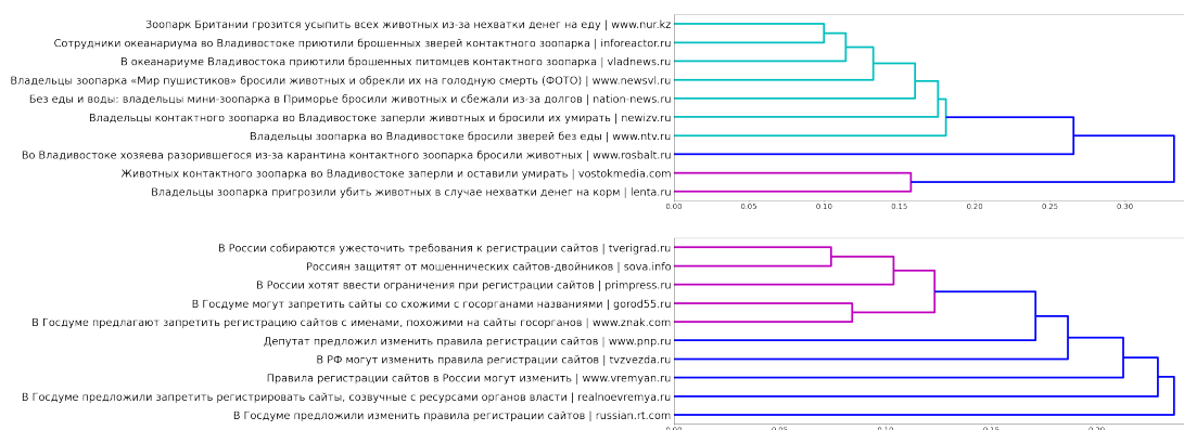
Figure 2: Dendrograms for two clusters based on USE embeddings, cosine similarity, and average linking. These clusters contain several errors.

As a baseline clustering algorithm, we utilized hierarchical agglomerative clustering with average linking.