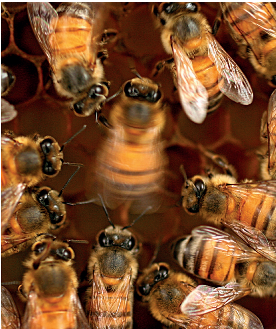
Honeybees use the 'waggle dance' to convey information about the location of a food source to a hive.