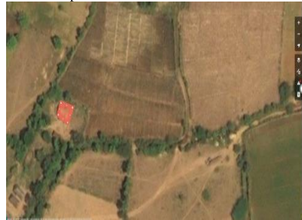
Figure(1) Labelling few building using polygon

It ought to be called attention to that building impressions must be incompletely improved within the sight of impediments. Figure(3) demonstrates the projection of a unique OSM impression in an aeronautical picture, while Figure (1) features the edges that can be advanced with the proposed strategy. Figure (2) is an aeronautical picture of the studied region with a marginally diagonal view. Given that no extra pictures are accessible, just the obvious structure outskirts (set apart with red lines) can be enhanced. Towards the objective to accomplish a total enhancement of the structure impressions, it is along these lines educated to obtain UAV pictures regarding the structures of enthusiasm from various review bearings with the goal that all the façades are obvious in the pictures.