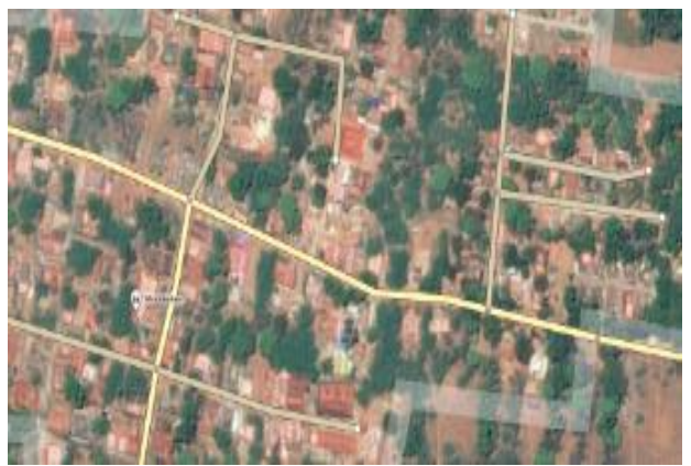
Figure(2) Labelling more building using polygon