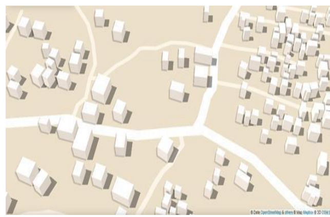
Figure(3) 3D of building image

Since the airborne pictures are pre-georeferenced, 3D directions of those basic picture correspondences can be determined by means of picture to-ground projection of the elevated pictures, and these 3D focuses are then embraced to gauge the camera postures of the comparing nadir-see UAV pictures. At last, those UAV pictures with realized camera stances are associated with a worldwide streamlining for camera postures of all UAV pictures. Along these lines, all UAV pictures get geo-enrolled. Utilized the product Pix4Dmapper Pro (rendition 4.0.25) for the procedure and direction of UAV data. The mean reprojection blunders of the four datasets are in the scope of 0.15–0.2 pixels.