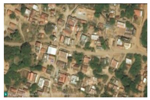
Figure (5) Square shape building input image

The different shape of buildings shown in the output image. (a)