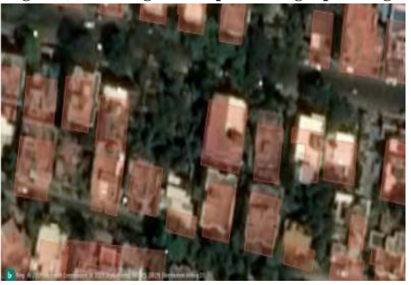
Figure (8) Rectangular shape building output image