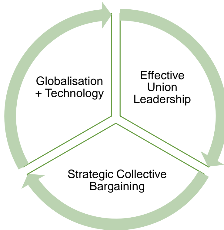
Figure 1. Tripartite relationship of unions, collective bargaining, and globalisation.

between unions and management emerges because both parties disengage when negotiating during labour issues discussions. In addition, the labour-management relationship is hostile irrespective of numerous attempts to advance collaboration through government policies and labour legislation in Europe (Bray et al., 2017). Consequently, the assumption is that unions and employers are counter-interactive because they have different goals and priorities (Martin et al., 2016). Yet, there is room for improvement on the condition that they trust each other and possess the necessary skills and knowledge to engage in effective and cooperative social dialogues (Obiekwe et al., 2018).