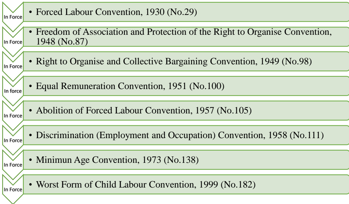
Figure 2. Eight fundamental ILO conventions ratified by SA.