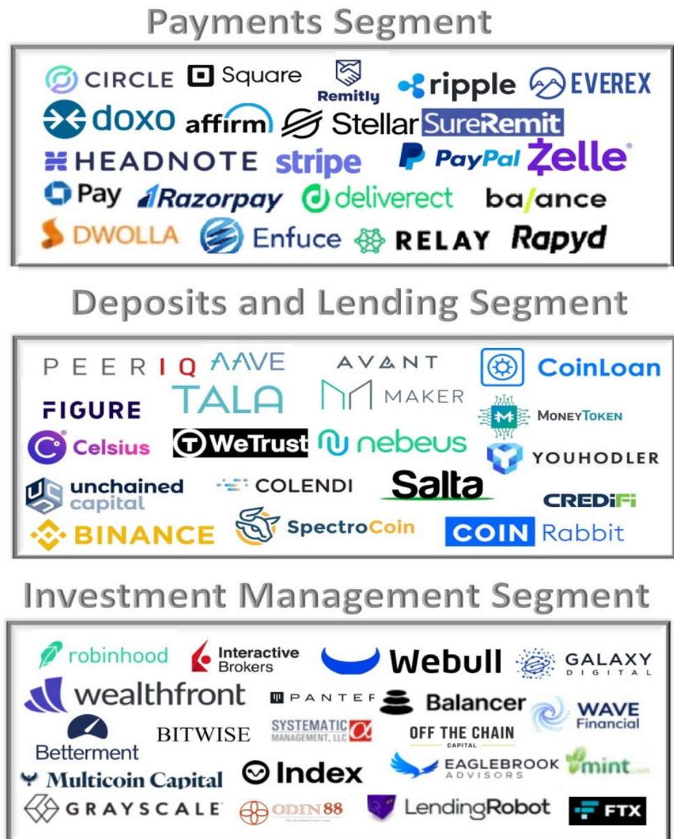
Figure 2. FinTech companies and segments.

Figure 2 shows a sample of the current FinTech companies within their assigned FinTech Segment.