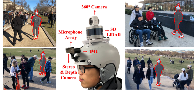
Fig. 1: Data collection in natural human-inhabited public spaces with the open-source sensor suite including 3D LiDAR, stereo and depth camera, IMU, microphone array, and 360° camera.

1 Website: https://cs.gmu.edu/~xiao/Research/MuSoHu/