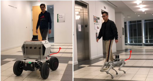
Fig. 4: Learned Obstacle Avoidance Behavior from MuSoHu.

methods, such as IRL, can utilize MuSoHu to learn a socially compliant cost function for downstream navigation planners [19].