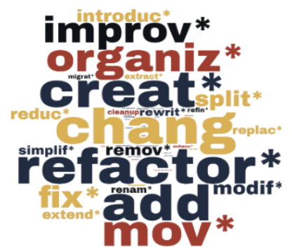
Figure 3: Popular refactoring textual patterns.

Approach. We manually inspect GitHub commits, issues, files to identify refactoring documentation patterns. These patterns are represented as a keyword or phrase frequently occurring in developer-ChatGPT conversations, as described in Section 2.