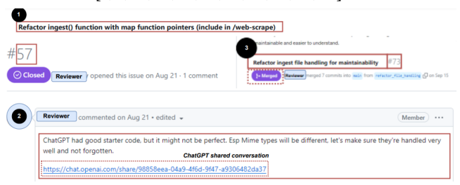
Figure 1: Example of a ChatGPT conversation in the context of GitHub issue about refactoring [1].

Artificial intelligence has been reshaping educational and industrial landscapes, and Large Language Models (LLMs) are emerging as the main driving force behind this revolution. The ability to harness massive amounts of information in multiple modalities allows LLMs to perform various tasks that would typically require human intervention [3, 4, 15, 20, 20, 22, 26, 27, 30, 34, 45].