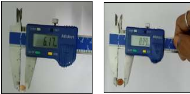
Fig.1. Measurement of size of soybean & chickpea seeds