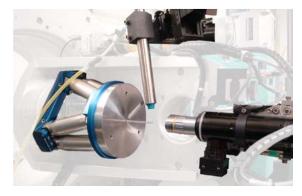
This hexapod places a sample at the centre of two large rotation stages. With this installation, hexapod mounting orientation varies between 0° and 90°. Advantages of the hexapod are: high stability, stiffness and repeatability of the sample position with respect to the rotation stages independently of their orientations.