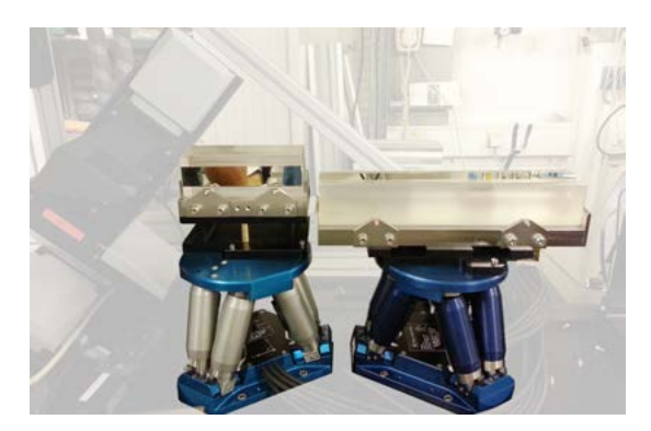
Two BORA hexapods position Kirkpatrick-Baez (KB) mirrors with high stability and resolution to improve the beam quality on a synchrotron beamline.