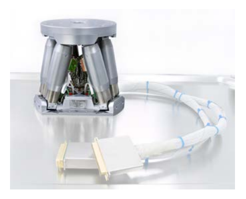
10<sup>-6</sup> mbar vacuum version to align a mirror on a satellite in a vacuum chamber during mounting and testing phases.