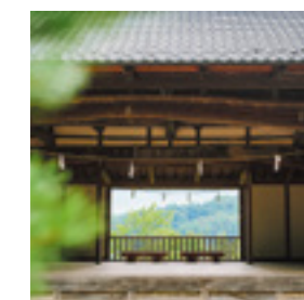
Bessho Jinja Shrine