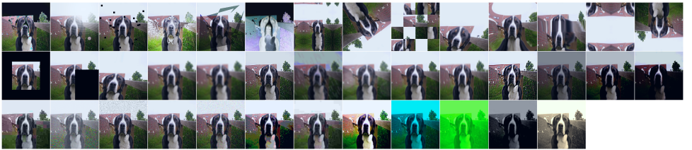
Figure 1: Candidate corruptions displayed in the same order as the corruption names of Figure 2.

The 40 considered corruptions form a heterogeneous set. It is difficult to determine the number and the kinds of corruptions to be included in a robustness benchmark a priori. In this paper, we propose a method to select groups of corruptions that make robustness estimations more correlated with robustness to natural corruptions.