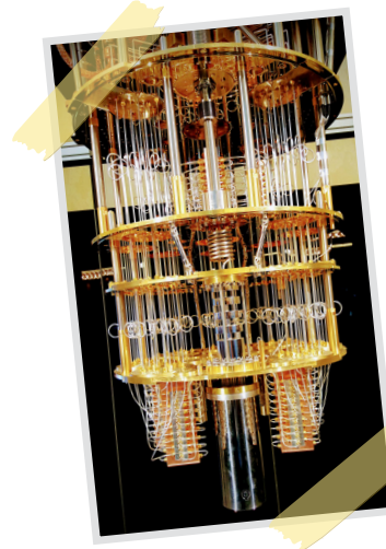
Figure 1: IBM Q System One, a 20-qubit quantum computer.

are protected by encryption relying on factorization. While very easy for a number like 15, this is very difficult for large numbers. In fact, it can take years on today’s computers! That’s because of the exponential growth it involves. These limitations are why scientists have attempted to create quantum computers (Fig. 1).