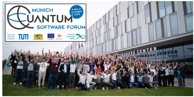
Fig. 3: Munich Quantum Software Forum

Additionally, 16 further software tools and initiatives were presented through brief pitch presentations and poster sessions. A video available at https://youtu.be/x99N7uOKJIU provides a brief summary of the event.