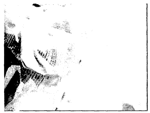
Figure 5: Fire Likely/Undetectable

There is one other case that contains fire that this method is unable to detect: if a sequence is recorded close enough to a fire, the fire may fully saturate the images with light, keeping the camera from observing changes or even colors other than white. Therefore, if contrast is very low and intensity is very high, as in figure 5, sequences are put into a "fire likely/undetectable" class.