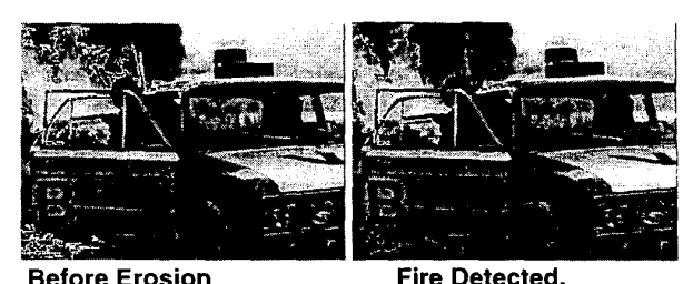
Before Erosion Fire Detected. Figure 6: Reflection on ground detected at lower left. In this and all examples, the detected location of fire is outlined in white.

One of the largest problems in the detection of fire is the reflection of fire upon the objects near the fire. However, barring surfaces with high reflectivity, such as