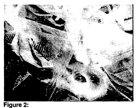
Translucent fire with a book behind it.

Fire is gaseous, and as a result, in addition to becoming translucent, it may disperse enough to become undetectable, as in figure 2. This necessitates that we