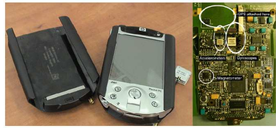
Figure 1. The MESH expansion pack, with an iPaq 5550 PocketPC. This provides accelerometer, gyroscope and magnetometer readings, as well as vibrotactile display.

Realistic synthesis of vibrotactile and audio sensations are key to building eyes-free interfaces. There has been a great deal of recent interest in physical models of contact sounds and associated vibration profiles. The model-driven approach is a fruitful design method for creating plausible and interpretable multimodal feedback without extensive ad hoc design. Yao and Hayward ([15]), for example, created a convincing sensation of a ball rolling down a hollow tube using an audio and vibrotactile display. A similar sonification of the physical motion of a ball along a beam is described in detail in [10]; subjects were able to perceive the motion ball from the sonification alone. A simple haptic “bouncing ball” on mobile devices was demonstrated by Linjama et al. [8], which used tap sensing to drive the motion of a ball; this, however did not incorporate realistic dynamics or auditory feedback. Granular approaches to realistic natural sound generation were explored in [9], where contact events sensed from a contact microphone above a bed of pebbles drove a sample-based granular synthesis engine. A wide variety