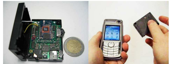
Figure 2. The wireless SHAKE sensor, shown with a 2 Euro piece for size comparison. This Bluetooth device comprises a complete inertial sensing platform.

of sonorities could be generated as a result of physical interactions with the pebbles. This granular approach is used as the synthesis engine in the Shoogles prototypes. Complete working prototypes of Shoogles have been implemented on both PDA and standard mobile phone platforms. There are three important components of Shoogles: the sensing hardware, to transform motion into measurable signals; the dynamics model, to simulate the motion of the virtual objects; and the display, which reveals the state of those objects.